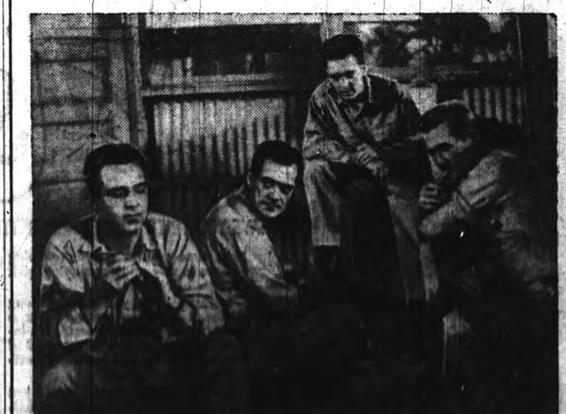
HOME OF THE BRAVE! A fabulous movie coming to Guion Hall on the 16th. The first movie of its kind ever filmed. This movie deals with the problem of racial prejudice.