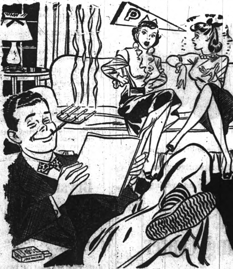
"It's no use, Mary, he's been like that since he discovered there's NO CIGARETTE HANGOVER when you smoke Philip Morris."