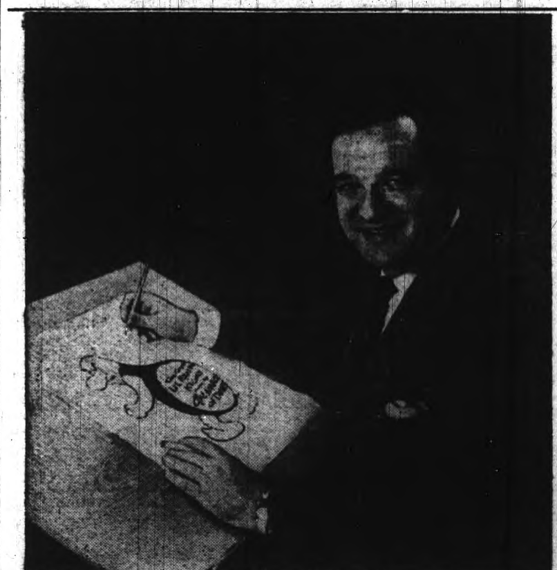
Cartoonist Al Capp, creator of L'I Abner, is shown putting finishing touches on his newest creation—the "L'I Abner Fello Bug Kigmy"—which he conceived expressly for the March of Dimes drive. Reproductions of it will be used in carnival-type booths throughout the country to raise money for the annual campaign sponsored by the National Foundation for Infantile Paralysis from January 16 through 31.