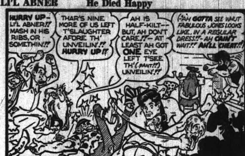
Merry Christmas Fum Mistuh Capp LI'L ABNER