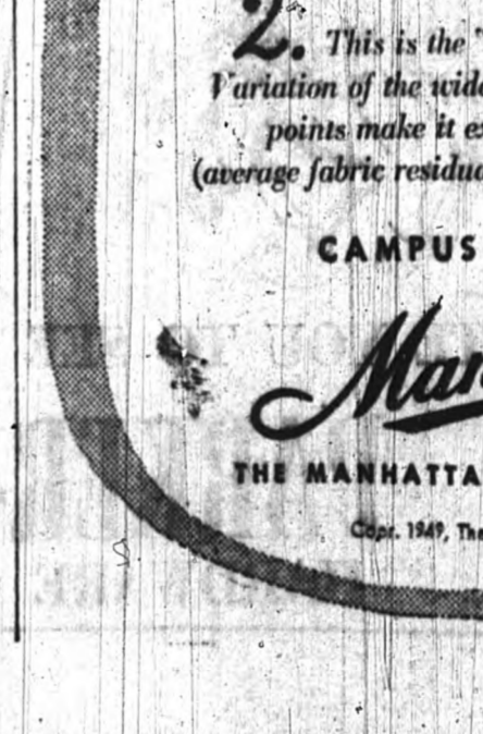
CAMPUS FAVORITE Manhattan THE MANHATTAN SHIRT COMPANY Sept. 1949, The Manhattan Shirt Co.

2. This is the "Manhattan" Ethan. Variation of the widespread collar—rounded points make it extra sharp. Size-Fix (average fabric residual shrinkage 1% or less).