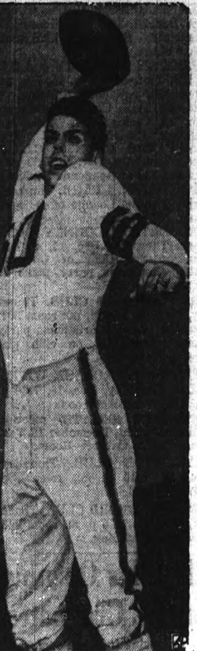
OTTO GRAHAM—Back Cleveland Browns