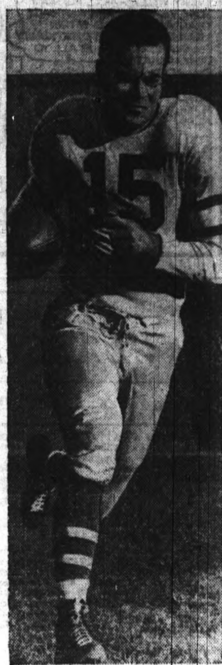
STEVE VAN BUREN—Back Philadelphia Eagles