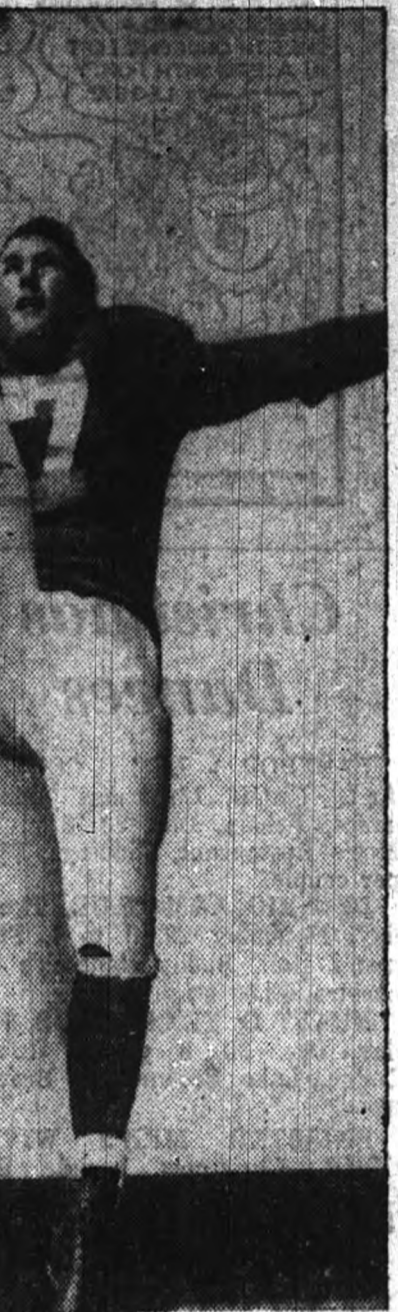
BOB WATERFIELD Los Angeles Rams