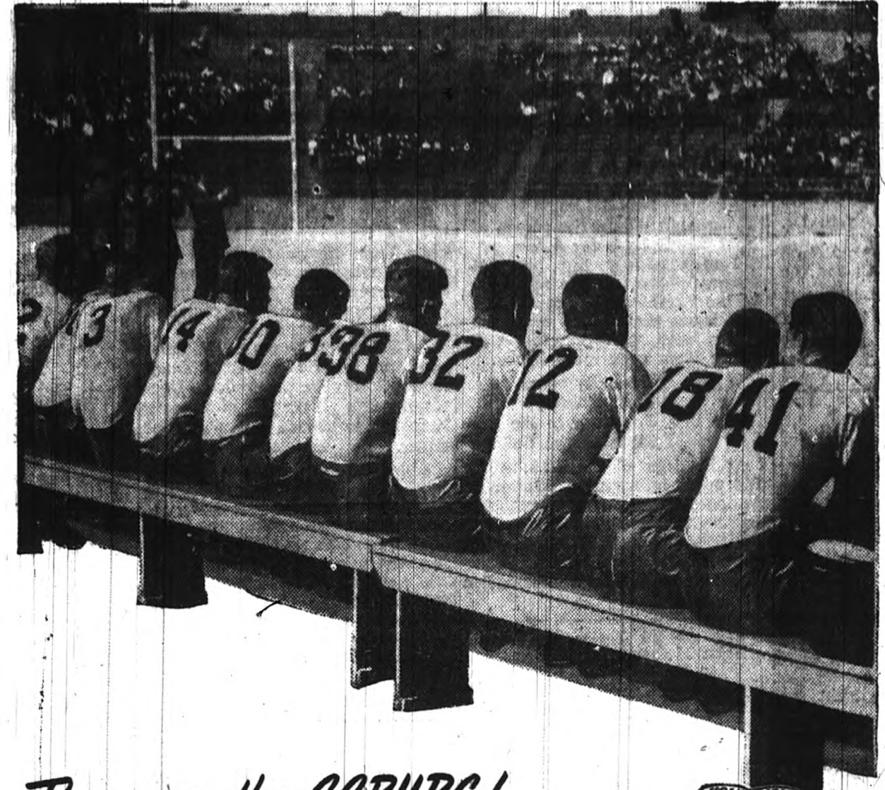
These are the SCRUBS!

They're warming the bench today. But next year most of these boys will be "regulars"—a few will become stars. They're waiting their chance.