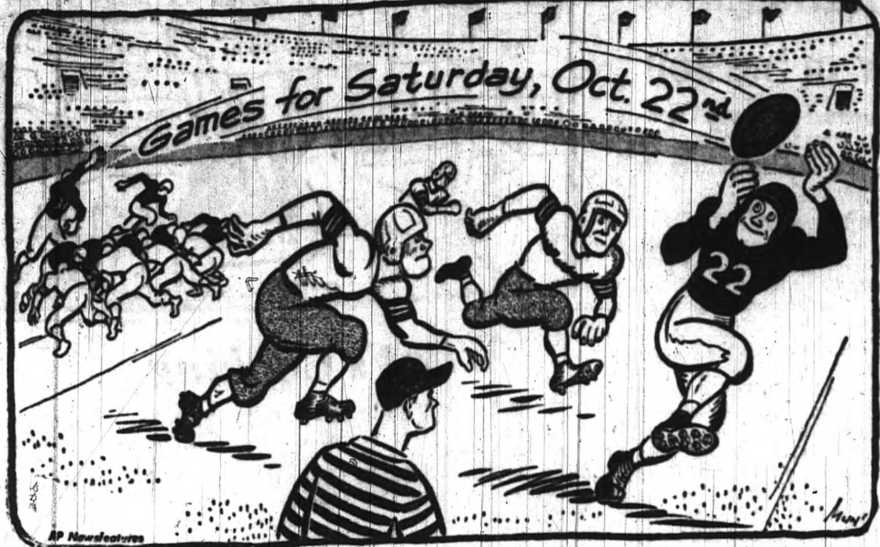
By FRANK ECKL