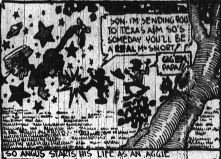
SON, I'M SENDING YOU TO TEXAS AM SO'S SOMEDAY YOU'LL BE A REAL M'SNORT!