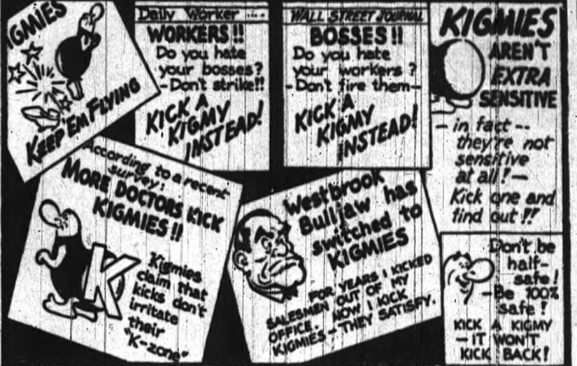
By Al Capp