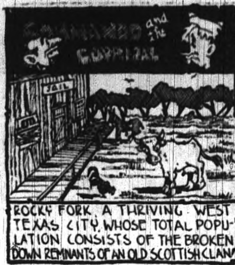
ROCKY FORK, A THRIVING WEST TEXAS CITY WHOSE TOTAL POPULATION CONSISTS OF THE BROKEN DOWN REMNANTS OF AN OLD SCOTTISH CLAN.