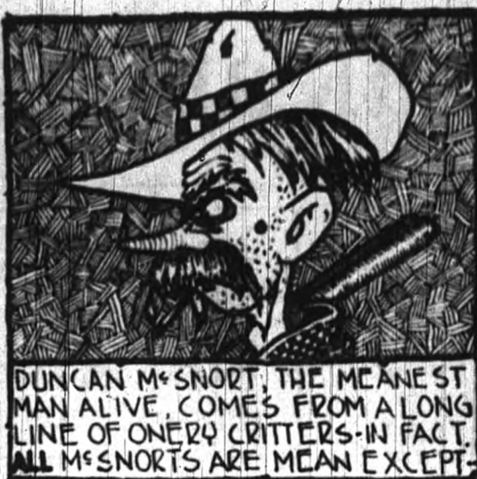
DUNCAN M'SNORT, THE MEANEST MAN ALIVE, COMES FROM A LONG LINE OF ONE-UP CRITTERS. IN FACT, ALL M'SNORTS ARE MEAN EXCEPT...