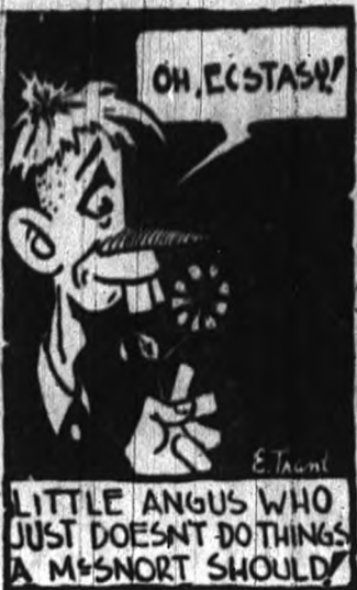
LITTLE ANGUS WHO JUST DOESN'T DO THINGS A M'SNORT SHOULD.