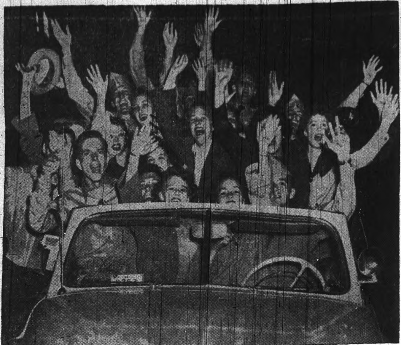
All available convertibles, like all available sleeping space, did double duty over the Fort Worth corps trip weekend. The people in Detroit probably wouldn't have believed their...