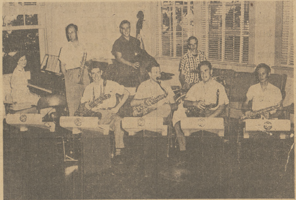
Above—Two-thousand five hundred dollars worth of equipment was bought for the Music Hall from EXCHANGE STORE profits. Directly using this equipment

CHANGE STORE. The grove with its new bandshell was the mecca of the summer recreation program at A&M.