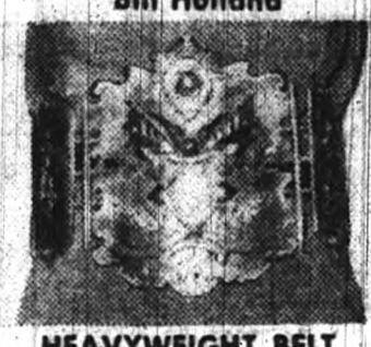
HEAVYWEIGHT BELT Ezzard Charles