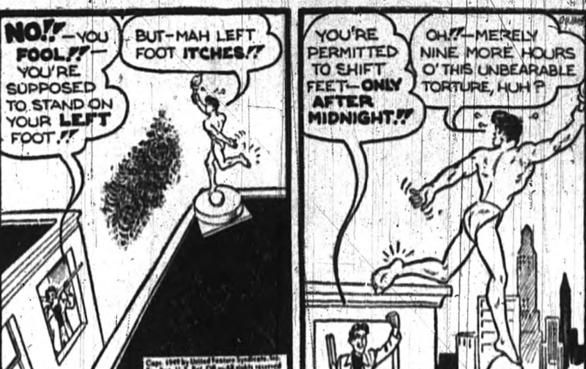
He's On the Ball