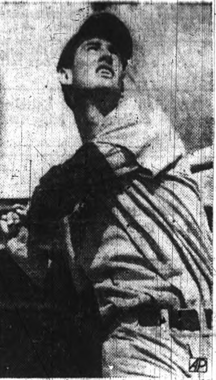
TED WILLIAMS Cheers or boos? 1946 at Fenway Park, Boston. He had a perfect day at the plate, with two homers, two singles and a walk to lead the attack in a 12-0 victory, the most one-sided of the 11 American League victories in 15 games thus far. Williams is the only American Leaguer ever to hit two homers in one All-Star

driven out nine hits in 18 official trips to the plate. Last year he had a torn rib cartilage and his only All-Star activity was a base on balls as a pinch hitter. Included in his blows are three home runs, two doubles and four singles. He has driven home nine runs. His best All-Star effort came in