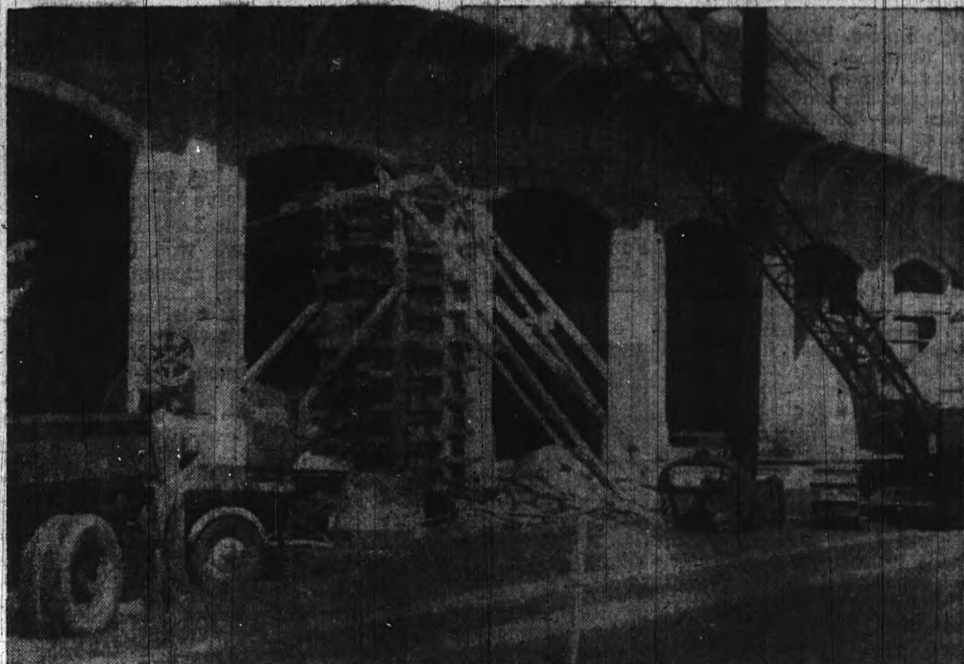
Frames for the concrete bases that will support the light poles around Kyle Field have been set and the work of pouring the concrete is underway. The concrete bases will extend 15 feet above the ground with the steel light poles set on top of them.