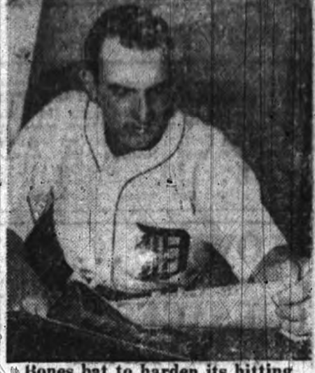
Bones bat to harden its hitting surface.