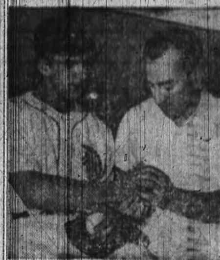
Has once-injured thumb examined by trainer.