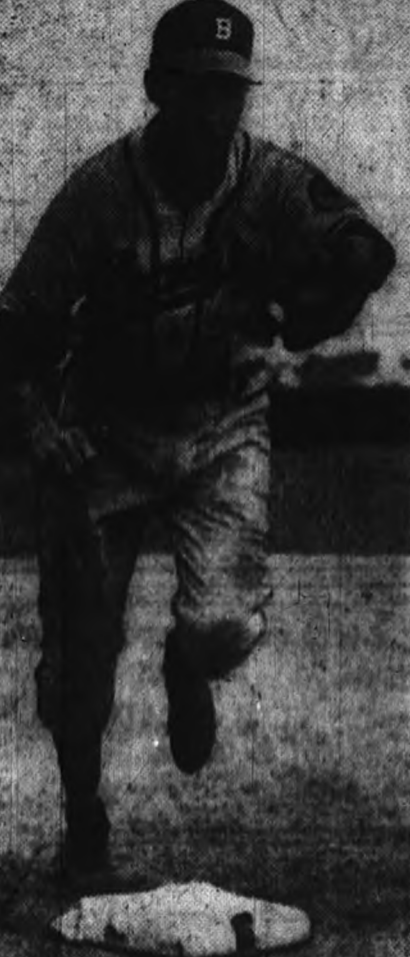
ALVIN DARK - Braves