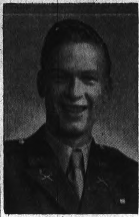
CHARLES C. SCHWAB