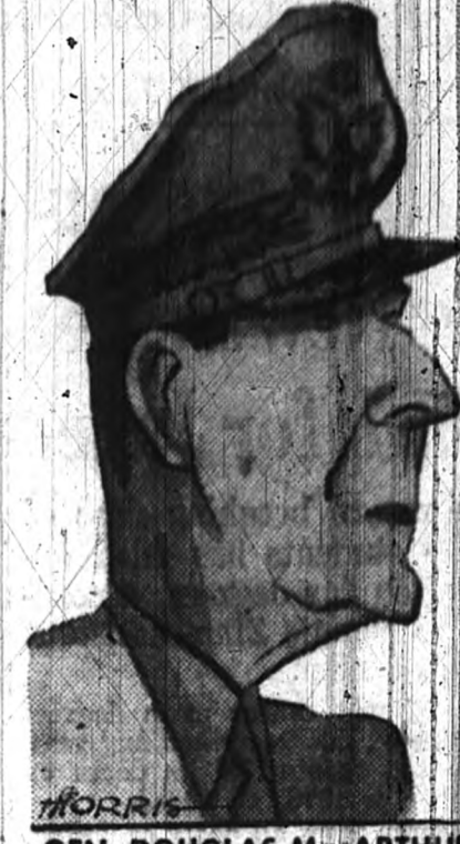
GEN. DOUGLAS MACARTHUR

This, he explained, is just another way to get A&M's name before the public.