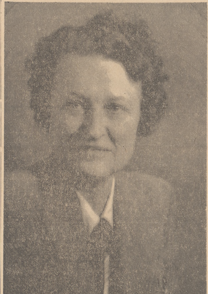
Judge Sarah T. Hughes of the 14th District will appear at a luncheon given by the Bryan-College Station AAUW March 19 in the Maggie Parker Dining Room, Bryan. Judge Hughes, who is state chairman of the committee on economic and legal status of women of the American Association of University Women, will be guest speaker for the occasion.

Bryan "Across from Postoffice" Phone 2-1645