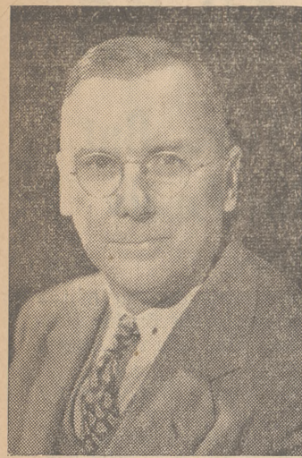
DR. HUGH L. DRYDEN , Director of Aeronautical Research of the National Advisory Committee for Aeronautics, lectures graduate students here Monday night.