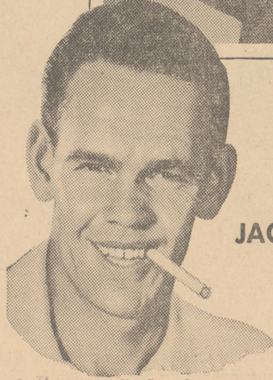
Copyright 1949, Liggett & Myers Tobacco Co.

JACK KRAMER says... "Because they're Milder Chesterfields taste better all the way. It's MY cigarette."