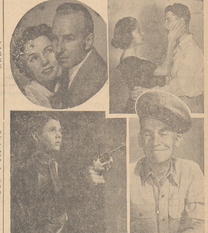
Texas' Hero, AUDIE MURPHY, who was honor guest at A&M's Military Ball Saturday night will be seen in the new movie "BAD BOY" which will be previewed at the Palace Theater in Bryan Saturday night at 11 p.m. In the movie, Murphy is seen as a wild youngster who reforms and comes to A&M to school.