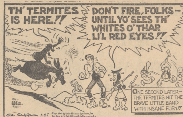
L'L ABNER Flicker Flush-Backs!