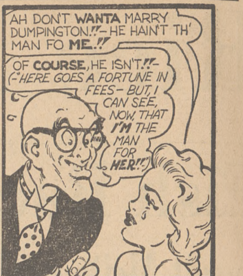
By Al Capp