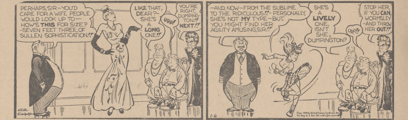
L'L ABNER How High Is Urp?