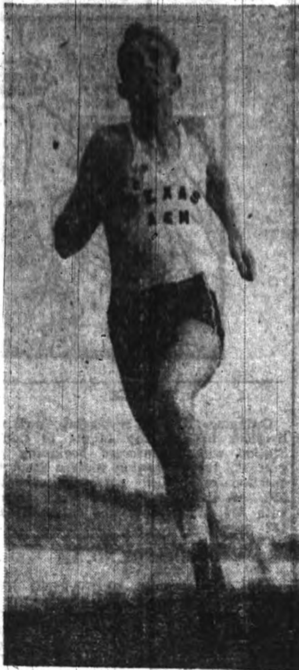
ART HARNDEN, blond headed Aggie track captain who became the first Southwest Conference athlete ever to win a gold medal in the Olympics, will not soon be forgotten by Aggie Track Fans for the many colorful races he ran for the Maroon and White.

Aggie Art Harnden became the first man from the Southwest Conference to win a gold medal in the Olympics when the American 1600 meter relay team, of which he was a member, scored a decisive victory in London Saturday. The American team, composed of Harnden, Cliff Bourland, Roy Cochran, and Mal Whitfield, finished some fifty yards ahead of the team from France, which was second.