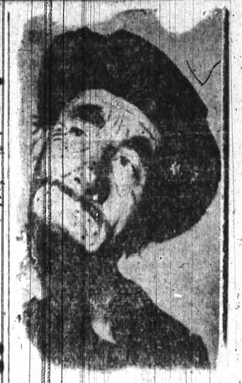
Above is a TRAMP COMIC from the GAINESVILLE CIRCUS.