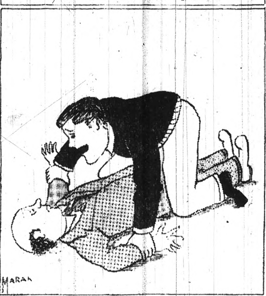
"Now then, professor, let's discuss my passing Physics!"