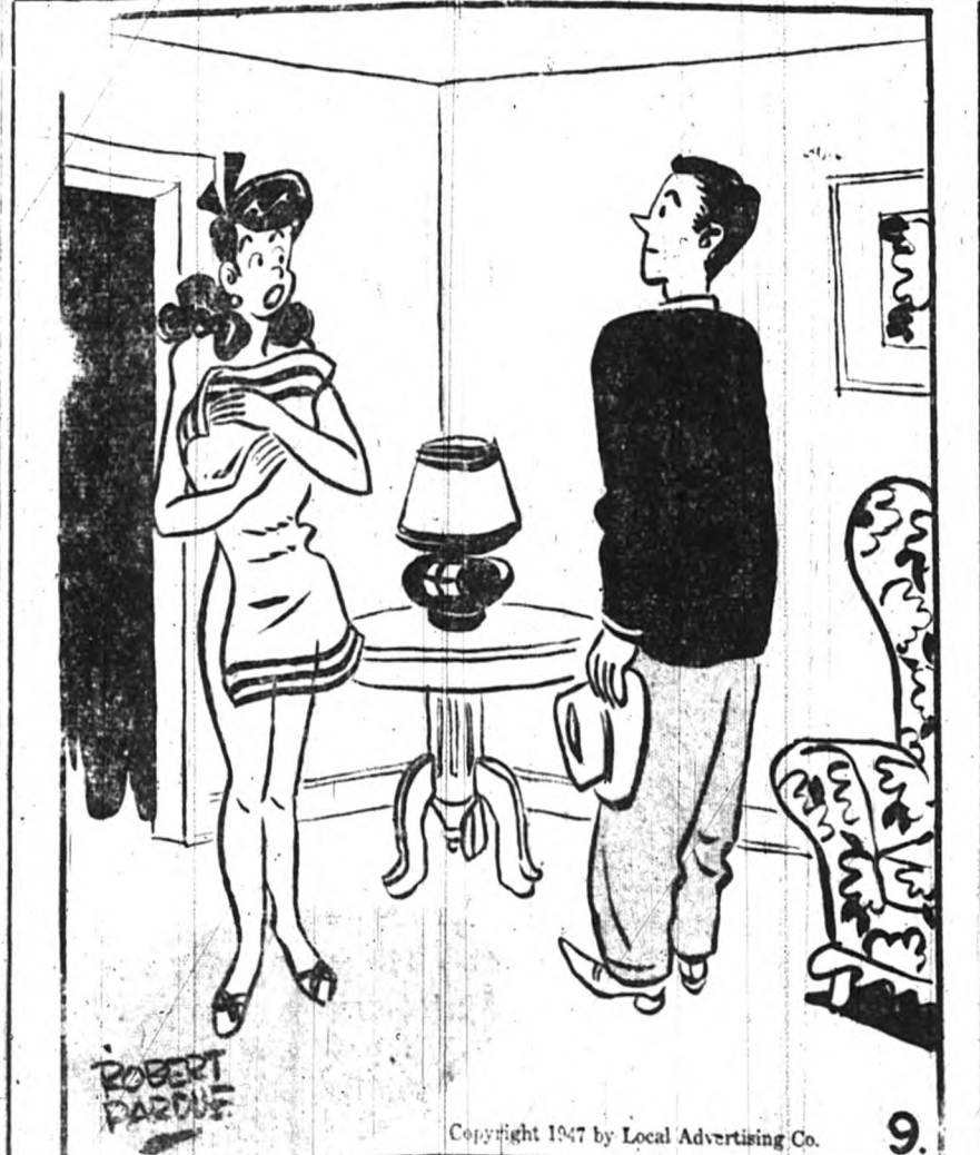
"My clothes will be back in 35 minutes, Bill—Mother just took them to THE LAUNDERETTE." LAUNDERETTE Southside - College Station