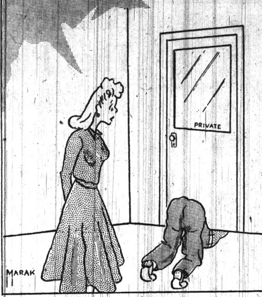
"But I tell you the dean isn't in!"