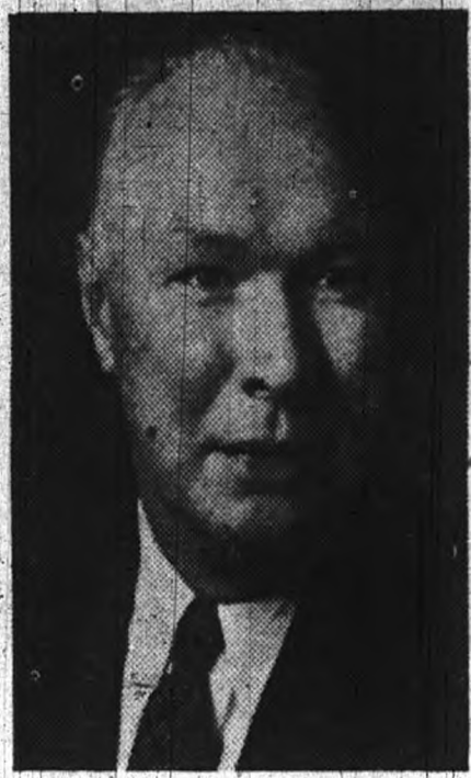
DR. WILLIAM V. HOUSTON , president of Rice Institute, will talk on the "Vibration of Crystals" in the Physics lecture at 8 tonight.

She asked the courts to stop the whole thing. That is what the Supreme Court's decision means: the Illinois authorities must do.