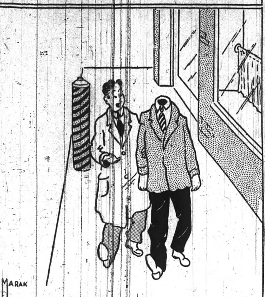
"I warned you about these North Gate barbers—but no, NO!"