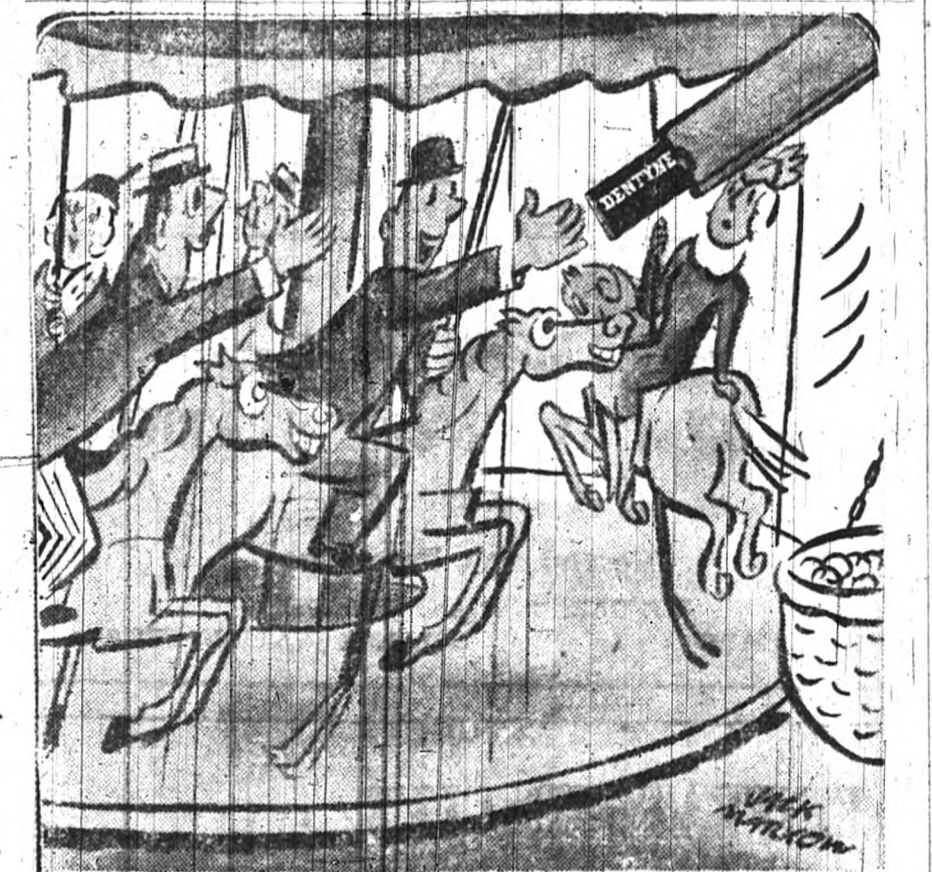
"Dentyne Chewing Gum!"

The Southwest Conference Championship tournament will be held in Houston May 13, 14, and 15.