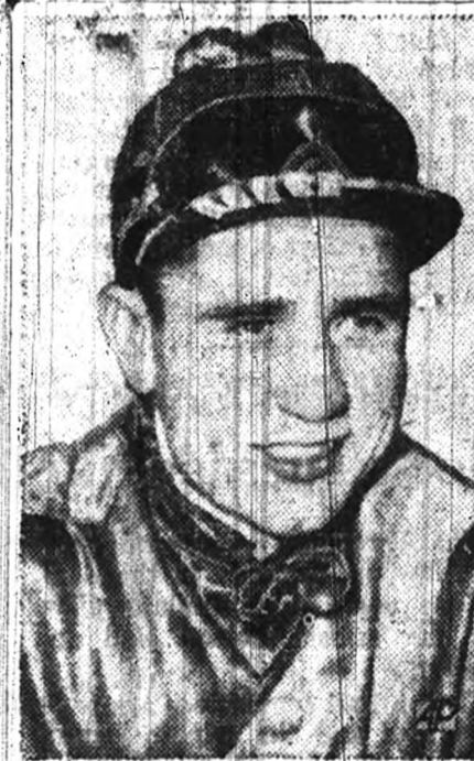
ACE JOCKEY — STEVE BROOKS, veteran jockey who was beaten by JOHNNY LONGDEN in the race for most winners in 1947, is off to a good start this winter. He's riding at the New Orleans Fair Grounds which ends a 75-day meeting on March 6.