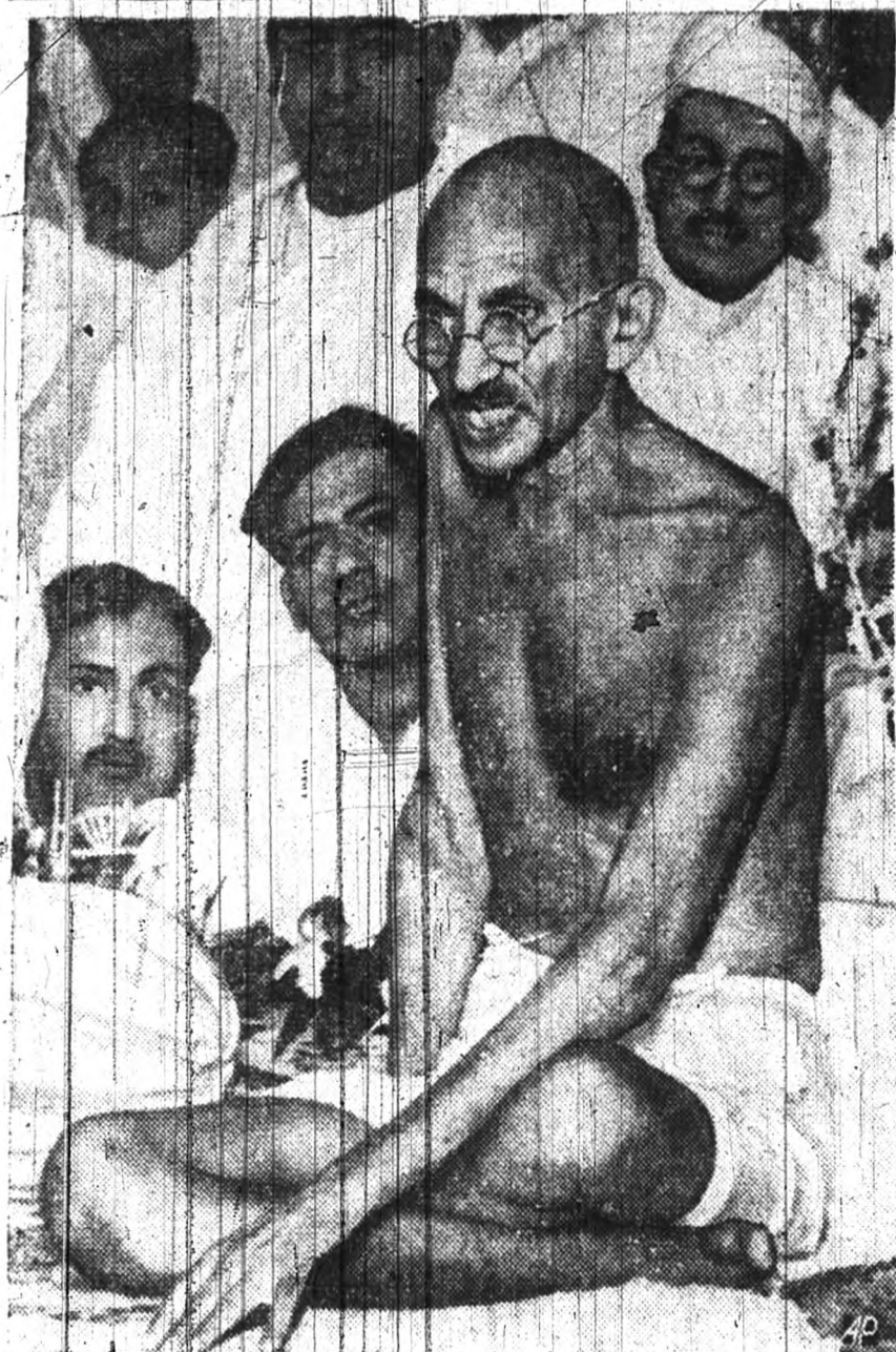
MOHANDAS KARAMCHAND GANDHI is shown here surrounded by his disciples. The Mahatma (Great Soul) of India fasted 10 times for his people, 3 of which lasted 21 days. His last fast resulted in peace promises from leaders of Hindu, Sikh and Moslem religions.