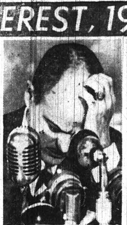
DRAMA: Maj. Gen. Bennett Meyers pauses to remember a point during his testimony before a Senate committee.