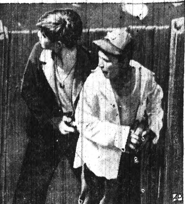
CRIME: A 15-year-old youth, left, holds a revolver against another boy and uses him as a shield during a gun fight with Boston police. A policeman captured the youth from behind.