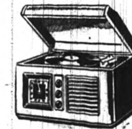
Radio-phonograph table model.

CAMPUS FRIDAY, SATURDAY, SUNDAY & MONDAY