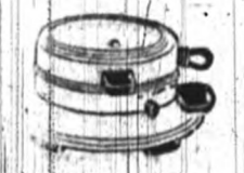
Waffle irons in shiny chromium.