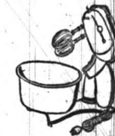
Electric mixer that serves a thousand purposes.