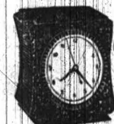
Electric clock — it turns on your radio and coffee-maker.