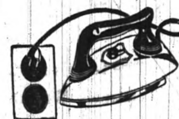
Light-weight iron with automatic controls for all fabrics.