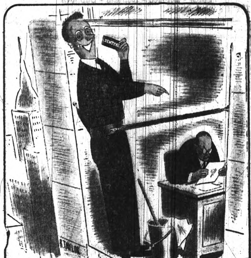
"He wouldn't let me chew Dentyne Gum in the office so I got an outside job."