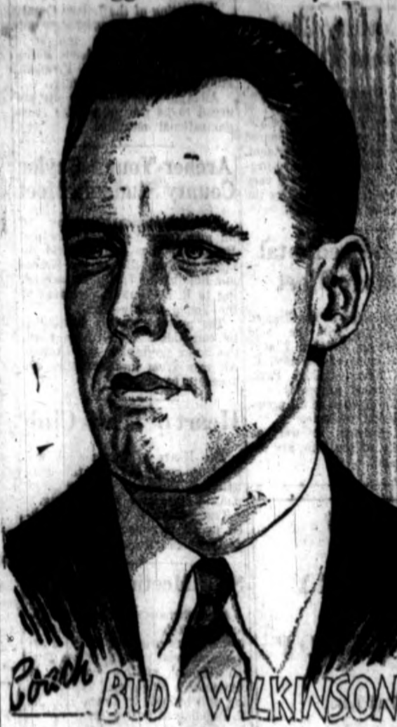
Coach BUD WILKINSON

Leading the Sooner charge against the Aggies Saturday in Norman will be "Bud" Wilkinson, new head football coach at O. U. Boasting a team that racked up the best defensive average per game in the nation last year, Wilkinson pilots a rough crew that shared the Big Six crown in '46.