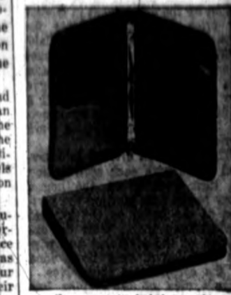
(From an unretouched photograph)

There are still openings on the staff of the Battalion for reporters and other assistants, as the new printing schedule requires a larger personnel than ever before. Those interested are invited to attend the meeting Friday.