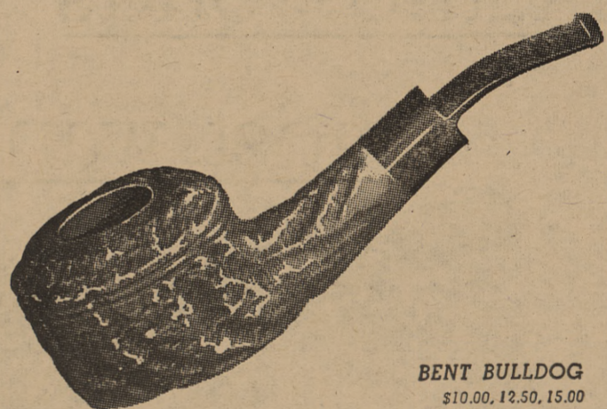
BENT BULLDOG $10.00, 12.50, 15.00

For every type... there's a "CUSTOMBILT PIPE"