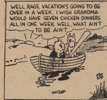
WELL RAGS. VACATION'S GOING TO BE OVER IN A WEEK. I WISH GRANDMA WOULD HAVE SEVEN CHICKEN DINNERS ALL IN ONE WEEK. WELL, WHAT AINT TO BE AINT.