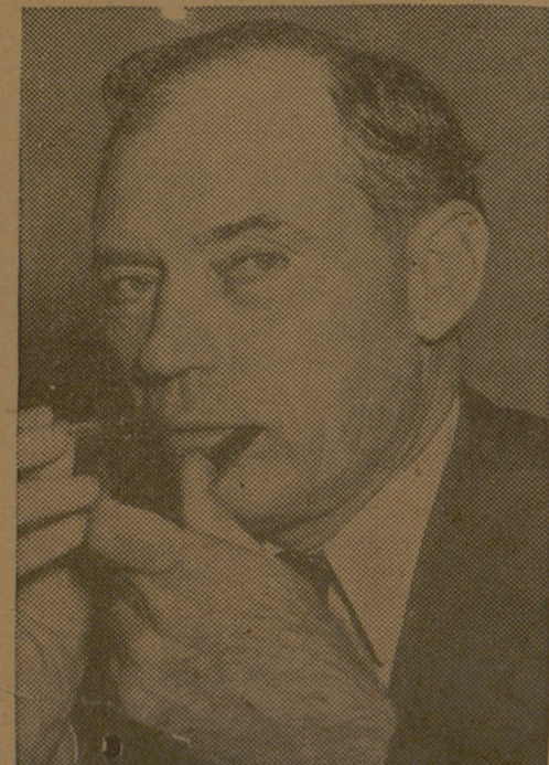
Coke R. Stevenson, chief executive of Texas, who will attend the San Jacinto Day muster at A. & M. this week-end.