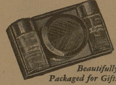
Beautifully Packaged for Gifts

Surfspray's complete line is especially designed to give men of good taste the deep down satisfaction that comes from using the best in masculine toiletry. Select your needs—Shave Bowls... Shampoo... Deodorant... Hair Groom... Cologne... After Shave Coolaire... Shower Soap... Talc and gift combinations.