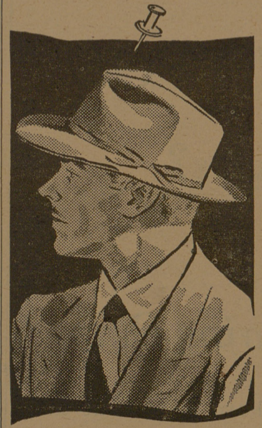
FOR THE BRISK, BUSINESS-LIKE AIR...