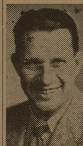
Penberthy a come-back and that team deserves a lot of credit, but we all look with pride on the team that shows improvement in each and every game—that it plays. People are a lot like teams in

In following the performances of athletic teams of different kinds it is interesting to note that some start off with a bang, stumble in mid-season and finish strong; others start off likewise, stumble in mid-season and then get worse as the season progresses and have a miserable finish; while still others start slowly, but improve with each game and wind up the season in fine shape. It takes a lot of courage, on the part of a team that has stumbled, to make a come-back and that team deserves a lot of credit, but we all look with pride on the team that shows improvement in each and every game—that it plays. People are a lot like teams in