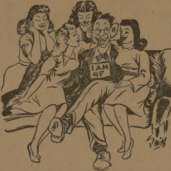
Now he's leaving