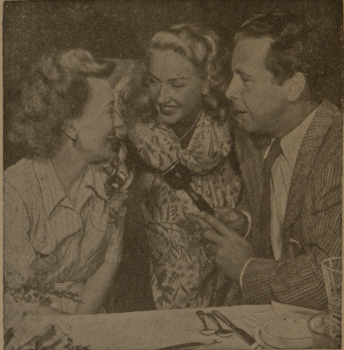
Ona Munson, Belle Watling of "Gone With the Wind", was a recent guest on the BLUE Network's popular noontime series "Hollywood Star Time" along with alluring Bonita Granville and Dick Powell. All of the stars are busily working on forthcoming RKO productions.