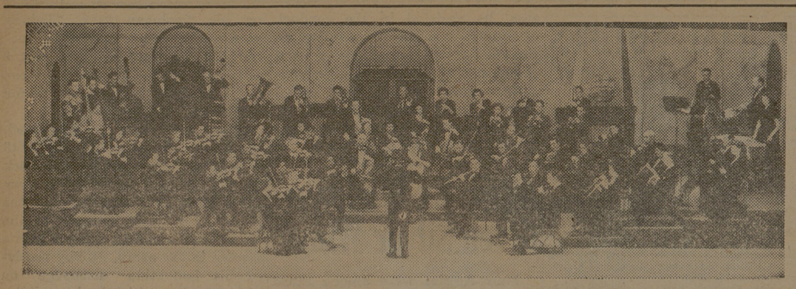
HOUSTON SYMPHONY ORCHESTRA—which will play on Kyle Field August 17.