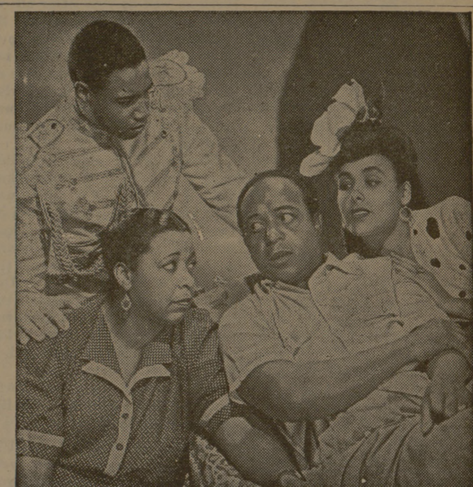
AT GUION—Shown above are the feature players of "Cabin in the Sky", currently showing at Guion Hall. "Cabin in the Sky" stars an All-Negro Cast, one of the first shows of its kind.