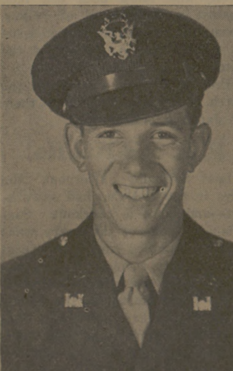
Shown to the left, President of the Junior Class at A. & M.